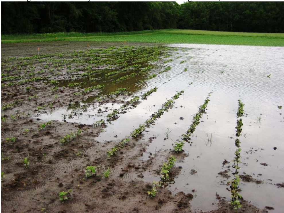
Image 1. Flooded soybean field located at Arlington WI, June 8 th 2008.

Severe flooding has many low-lying soybean fields underwater. As the water dissipates yield potential and replant questions will arise. Flooding can be divided into either water-logging, where only the roots are flooded, or complete submergence where the entire plants are under water (VanToai et al., 2001). Water-logging is more common than complete submergence and is also less damaging. Soybeans can generally survive for 48 to 96 hours when completely submersed (Image 1). The actual time frame depends on air temperature, humidity, cloud cover, soil moisture conditions prior to flooding, and rate of soil drainage. Soybeans will survive longer when flooded under cool and cloudy conditions. Higher temperatures and sunshine will speed up plant respiration which depletes oxygen and increases carbon dioxide levels. If the soil was already saturated prior to flooding, soybean death will occur more quickly as slow soil drainage after flooding will prevent gas exchange between the rhizosphere and the air above the soil surface. Soybeans often do not fully recover from flooding injury.